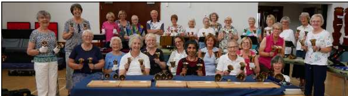
Handbell ringers from our six counties rallying for the 40th anniversary.