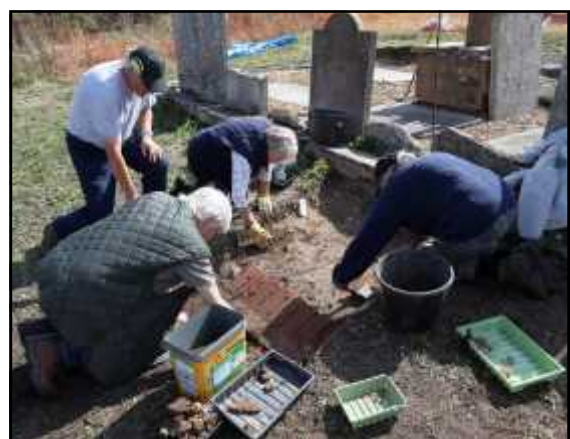
Trainees experiencing what it is like to be part of an archaeological dig.