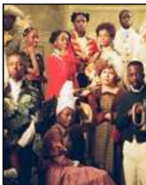
Study aids ... Black Tudors, Thomas Clarkson and a BBC still of TV's Black and British.

AFTER watching David Olusoga's BBC TV programme "Black and British" and reading Miranda Kauffman's "Black Tudors", I began to realise that there was a certain part of Britain's History that was being either ignored or forgotten or, worse still, hidden.